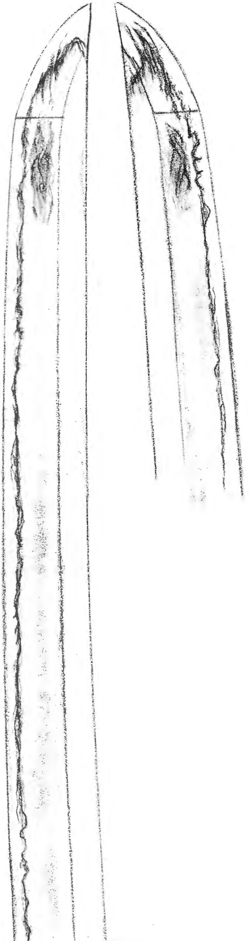
NOBUTSUGU Katana OWARI PROVINCE c.1528