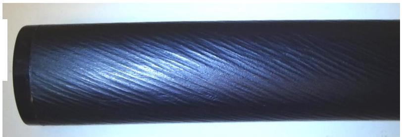
Figure 4 → Refinished saya in patterned black urushi