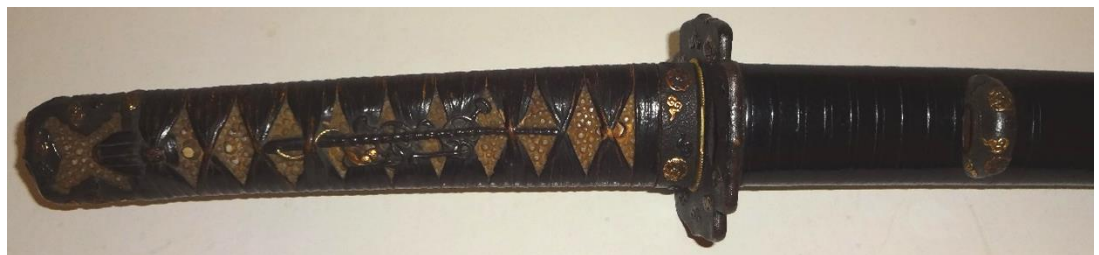
Figure 3a Kashira replicated by an expert in the U.K.