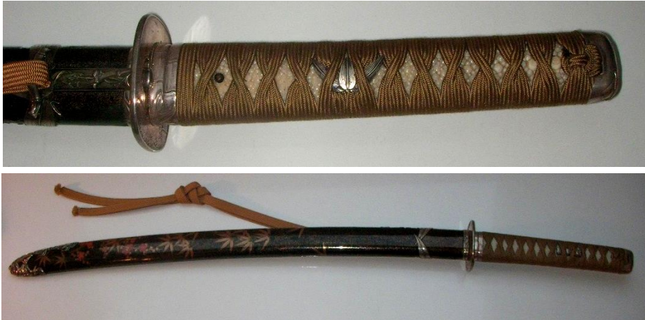
Figure 3b Two views of the complete koshirae with the replicated koshira