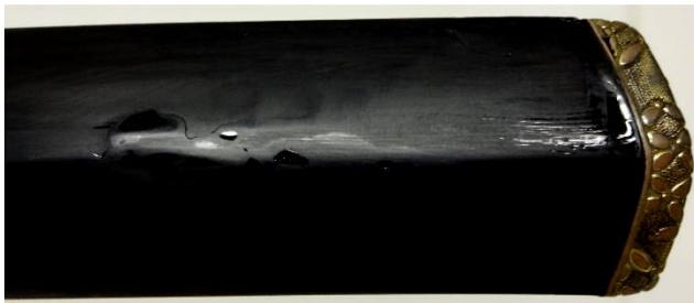
← Figure 5 Urushi repair on a damaged koshirae